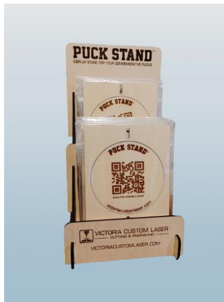
Puck Stand™ Counter Display