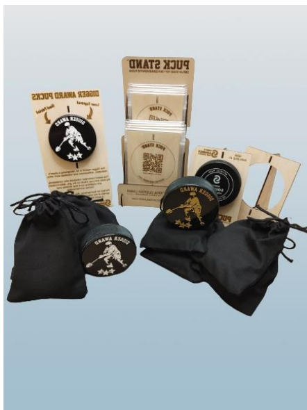
Kirby's Digger Award Order