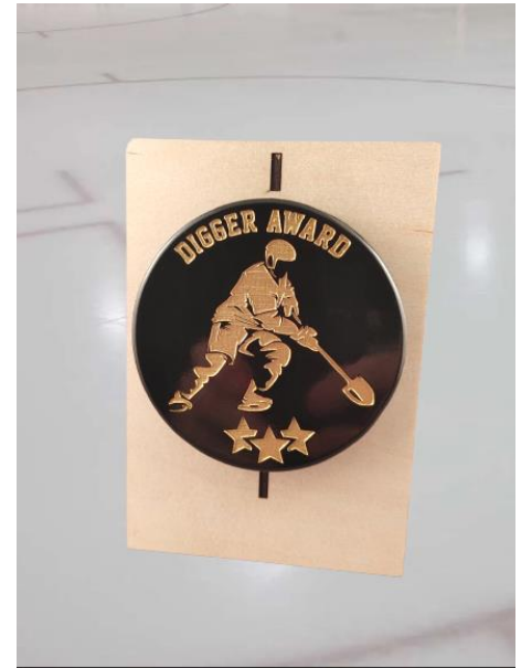
Puck Stand™ with Digger Puck