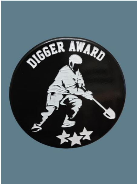
Digger Award Puck - White