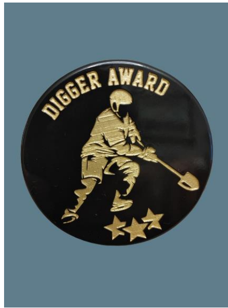
Digger Award Puck - Gold